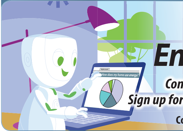
Chart Your Energy Usage.

Conduct an online energy audit. Sign up for MyAccount at nvenergy.com