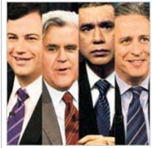
Another Fine Mess: Comics Whack Obama

Home | World | U.S. | N.Y./Region | Business | Technology | Science | Health | Sports | Opinion | Arts | Style | Travel | Jobs | Real Estate | Automobiles | Back to Top Copyright 2009 The New York Times Company | Privacy Policy | Terms of Service | Search | Corrections | RSS | First Look | Help | Contact Us | Work for Us | Site Map