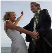
Weddings and Celebrations