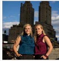
Jobs Wanted, Any Jobs at All